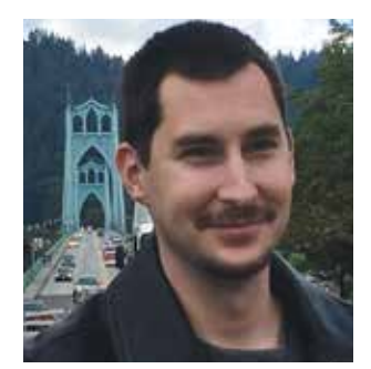
He now works as a court clerk for Yamhill County